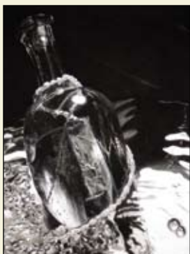
2008 Best of Show Winner (from Wawasee High School) Krista Spearman - "Message in a Bottle" 2008, Charcoal