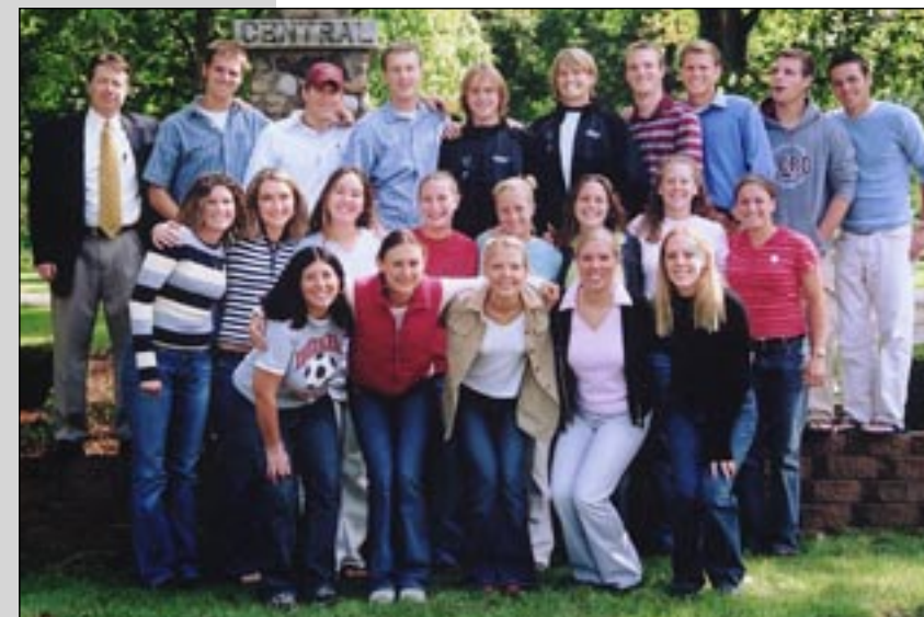
The 2003-04 Student Senate members have raised well over $10,000 to establish a new endowed scholarship.

For more on this story, visit our web site: www.huntington.edu/hcnews/0304/studentssenate.htm