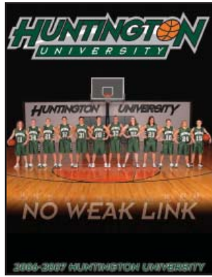
The award-winning cover of the women's basketball media guide