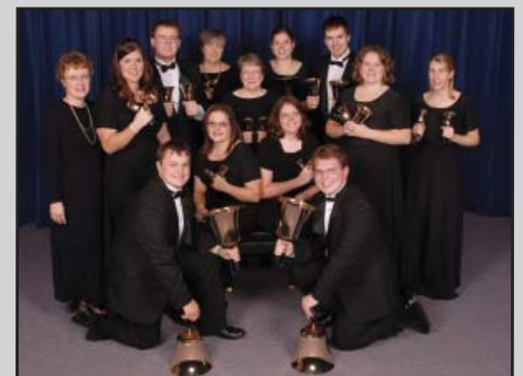
The Huntington University Handbell Choir

Huntington University celebrated Christmas with a "Christmas Celebration," a concert by the Department of Music on Nov. 30; performances of "The Gift of the Magi" on Nov. 30 and Dec. 1; the 53rd annual Huntington performance of Handel's "Messiah" at St. Mary's Catholic Church on Dec. 2; and a performance of the Holiday Pops by the Fort Wayne Philharmonic on Dec. 9.