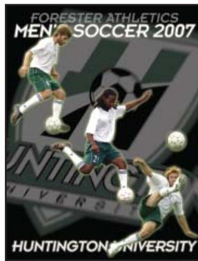
The award-winning cover of the 2007 men's soccer media guide