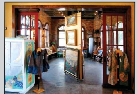
The interior of the Art Depot in downtown Huntington