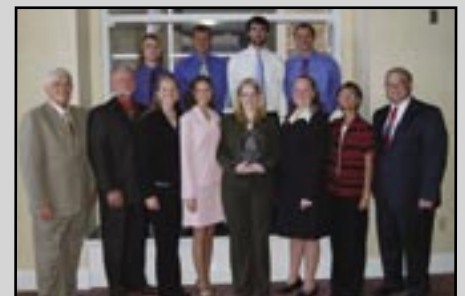
Members of Omega Psi and their faculty sponsors receive the ACE Award at Kappa Delta Pi's Biennial Convocation in Orlando, Fla. Only 35 of the more than 600 Kappa Delta Pi chapters earned the recognition.