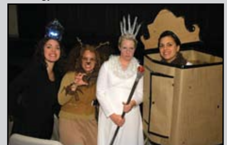
Students celebrate the annual Forester Night by dressing up as a favorite actor or character, including some of the cast and even a prop from "The Chronicles of Narnia: The Lion, the Witch and the Wardrobe."