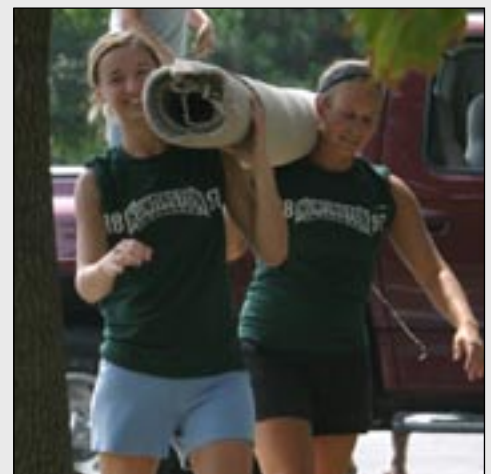
Returning students welcomed incoming freshmen on Friday, August 27, by helping them move into the residence halls.

11 a.m. Men's & Women's Tennis Match 11 a.m. - 1:30 p.m. 5-Year Class Reunions 11:30 a.m. - 1 p.m. All-School Lunch 12 p.m. Women's Soccer Game 1:30 - 3 p.m. Campus Safari 1:30 - 3 p.m. Departmental Reunion 2 p.m. Compleat Works of Wllm Shkspr (abridged) 2:30 p.m. Men's Soccer Game 5 p.m. Alumni Family Dinner & Awards 5:30 p.m. Alumni Baseball Game 7 p.m. & 9:30 p.m. Davis Hall Follies