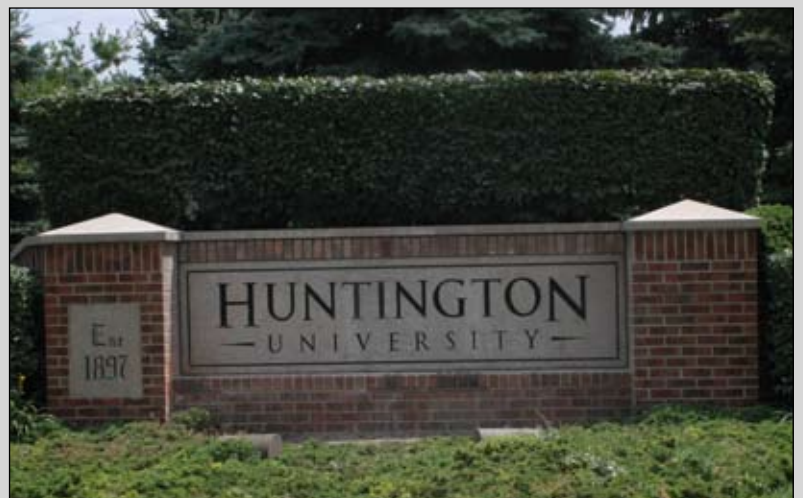
Visual university changes are becoming frequent throughout the summer months. Several signs on- and off-campus are making the change from "college" to "university."