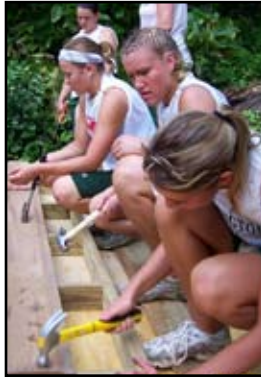
The Forester women's basketball team took a mission trip to Jamaica where they built a home and ministered to young girls and others.

For news and up-to-date results of Forester Athletics, visit www.huntington.edu/athletics .