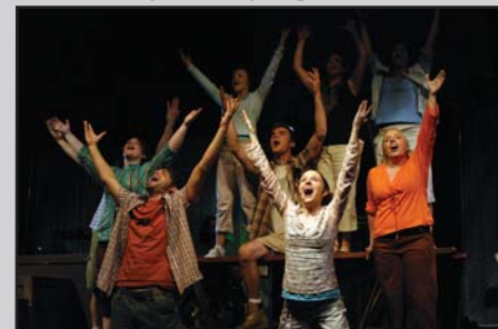
The "Godspell" cast performs at Emmanuel Community Church in Fort Wayne, Ind. Each "Godspell" performance has been the end result of a two and a half week rehearsal intensive "boot camp."

The traveling theatre troupe from Huntington University will present "Godspell" for the last time at 7 p.m. on Aug. 6 in the Zurcher Auditorium of the Merrillat Centre for the Arts. The show is free and open to the public. This summer, 12 students and two alumni from the University presented "Godspell" at churches throughout the Midwest and Mid-Atlantic regions. The group performed more than 40 shows between June 8 and Aug. 6. For more information, log on to www.huntington.edu/godspell .